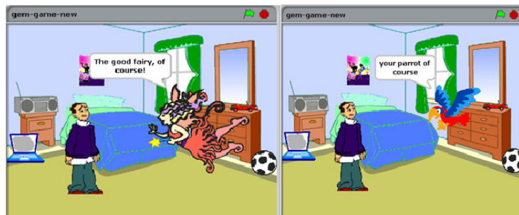
Fig. 3. Altering the avatar of the fairy in the Gem Game

We performed a between groups experiment with eighty students, fifty-three boys and twenty-seven girls (12 to 13 years old). All the students who participated in the experiment attended the first grade of junior high school. They formed four equivalent (age, gender, average grades) groups of twenty students each who practiced with the math game in three different ways. The first group played the storytelling game, the second played the same game but without the story, and the third was engaged with changing the game code. The last group (control) practiced traditionally by solving exercises on paper.